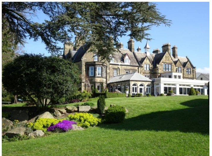
Swanwick (present day)