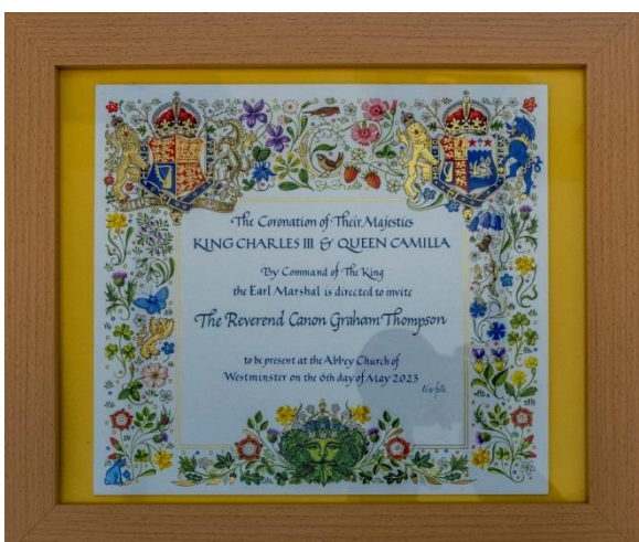
The Royal invitation