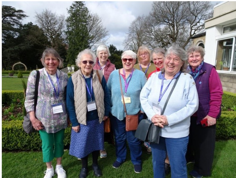
Some of our East Anglia ladies

Overall this was a brilliant weekend - roll on 2027.