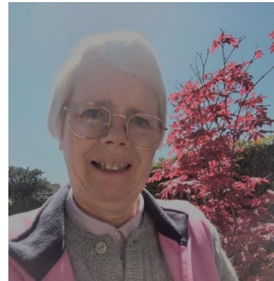
Selfie in our garden!